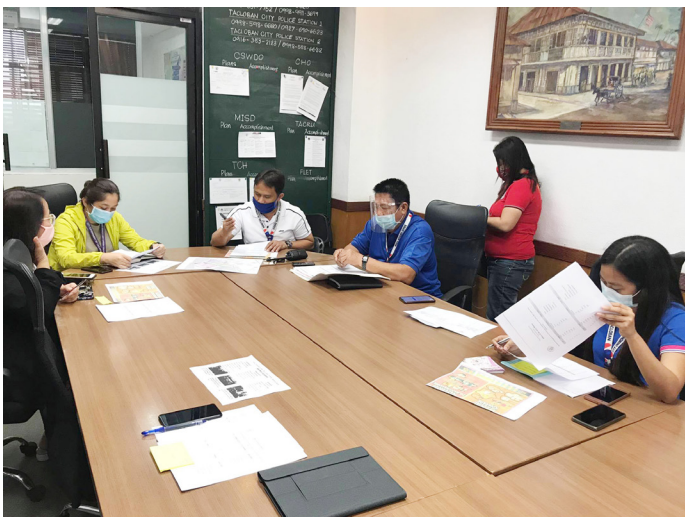
Personnel from the different departments of the Tacloban City Hall met on July 15 to discuss on the resumption of information dissemination of the city's 'no segregation, no collection campaign.'