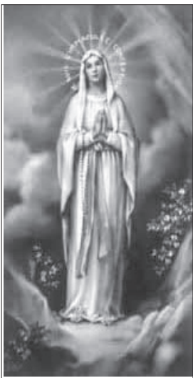
Pray the Holy Rosary daily for world peace and conversion of sinners (The family that prays together stays together)

Commentaries from readers whose identities they prefer to remain anonymous can be accommodated as “blind items”. It will be our editorial prerogative, however, to verify the veracity of such commentaries before publication.