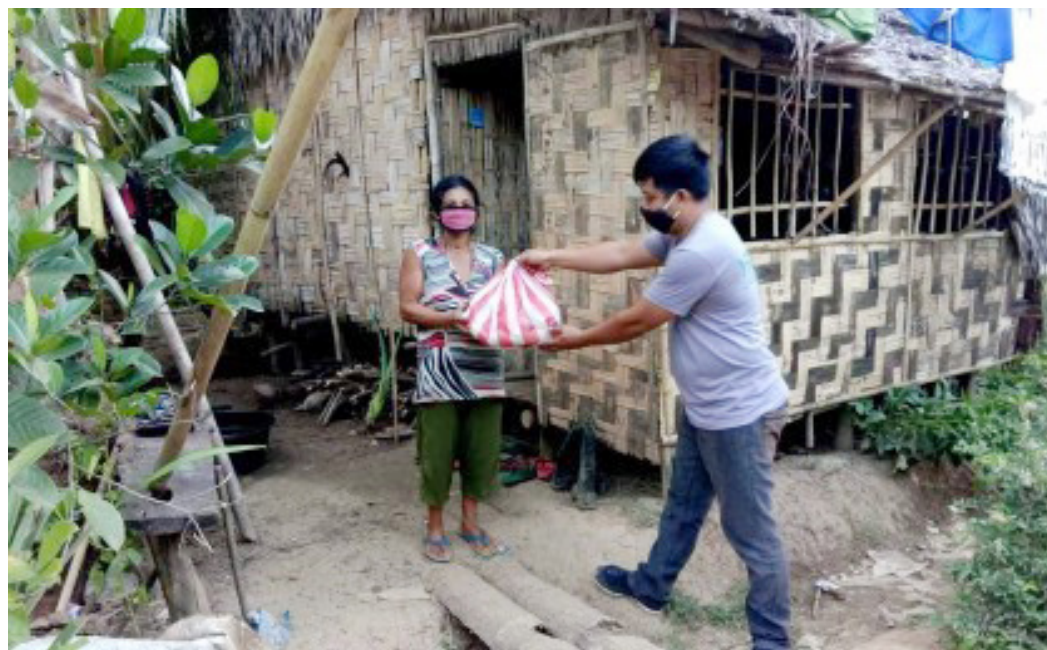
AID FOR FARMERS. An agrarian reform beneficiary in Eastern Samar receives a relief pack from the Department of Agrarian Reform (DAR) in this June 9, 2020 photo. The department said Friday (July 17, 2020) about 13,000 agrarian reform beneficiaries in Eastern Visayas have received food packs and hygiene kits as assistance amid the health crisis.