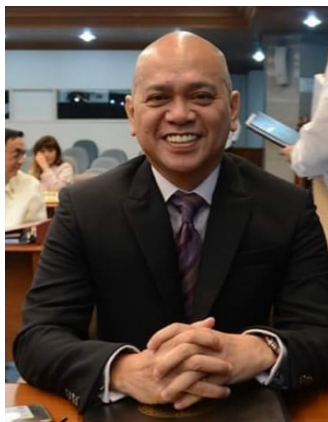
Rep. Florencio Noel

Noel informed that the DBM Budget Circular No. 2020-4 entitled Upgrading the Entry Level Nurse Positions was issued to prescribe the rules and regulations on the upgrading of the entry-level nurse positions to SG15 as well as to highlight the administrative procedure in view