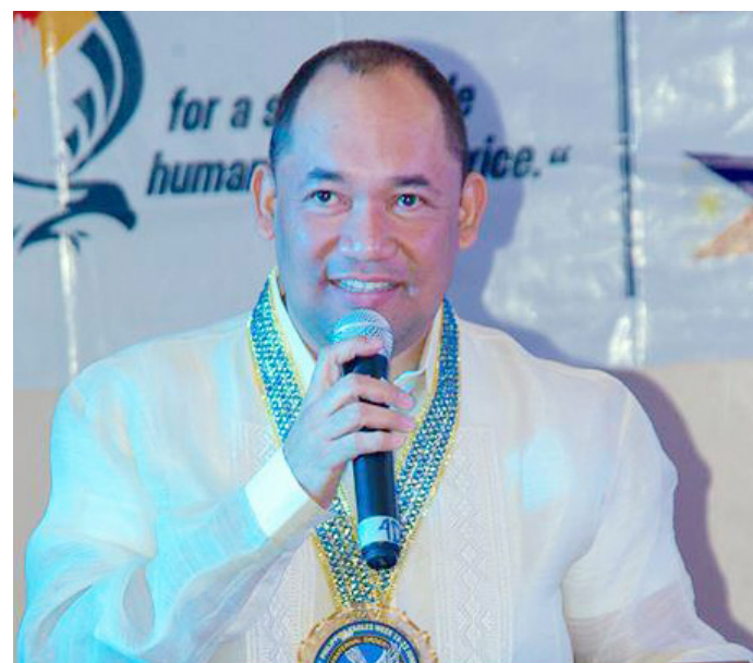
VICE GOVERNOR CARLO LORETO

He added that the legislative building shall strictly