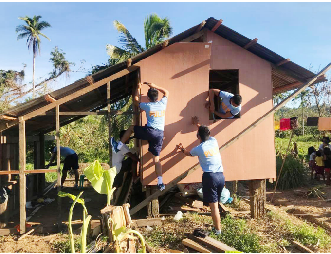
A poor family in Dolores, Eastern Samar whose house was destroyed when they were hit by typhoon 'Ambo' on May 14 got an unexpected help from the local police who help in rebuilding their house.

TACLOBAN CITY – A poor family in Dolores, Eastern Samar whose house was destroyed due to the onslaught of typhoon 'Ambo' received a gift from local police of the town.