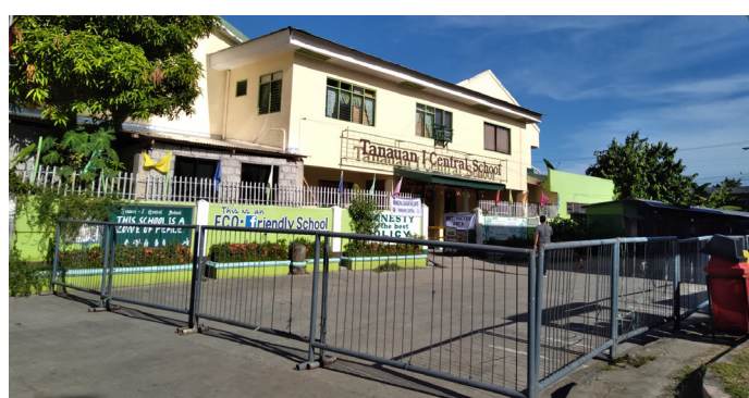
As the school opening is approaching, the regional office of the Department of Education is asking local government units to vacate schools they converted as isolation centers. Photo shows the Tanauan I Central School in Tanauan, Leyte among the municipality's isolation facilities for those who are returning coming from Metro Manila and other parts of the country.