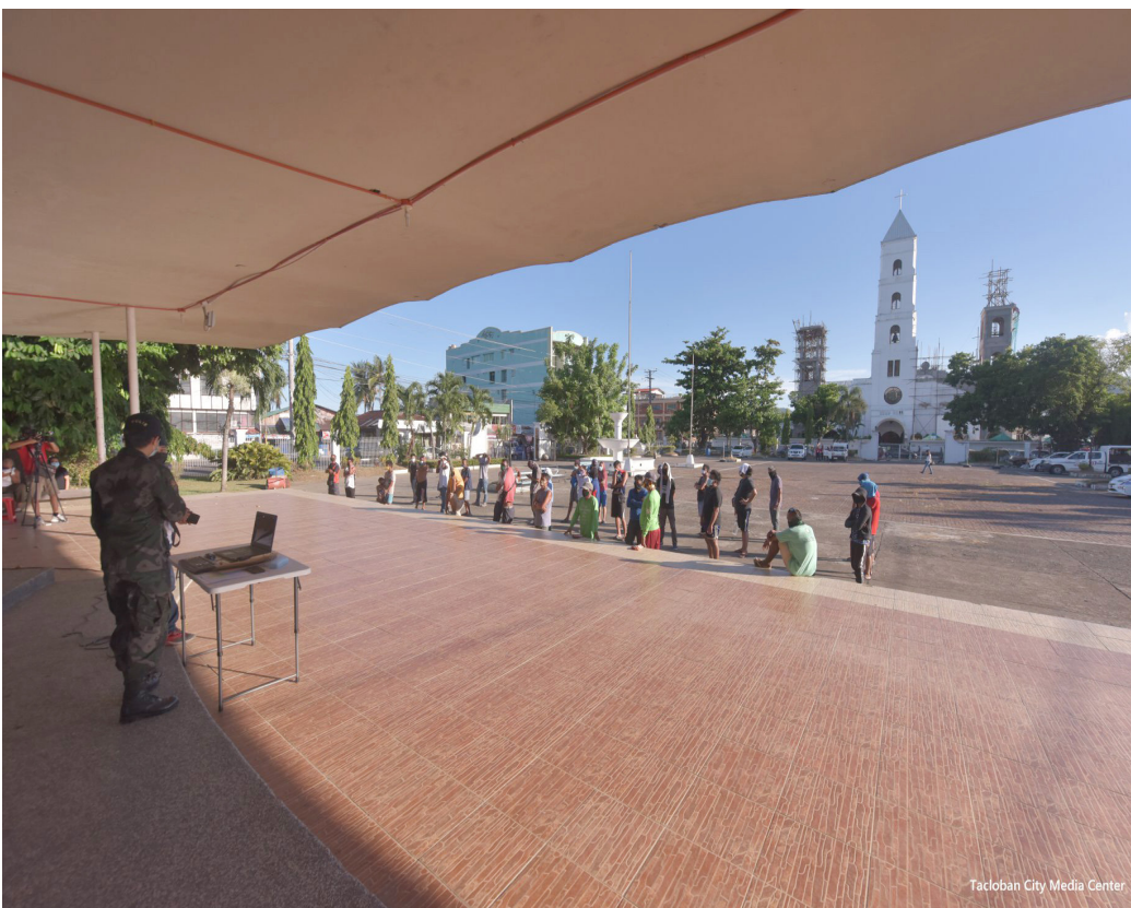
With Tacloban City registering its first COVID-19 case, the city government is mandating the public to strictly observe the wearing of face mask as contained under Ordinance Number 2020-14-07. Violators could face of penalty as high as P5,000.