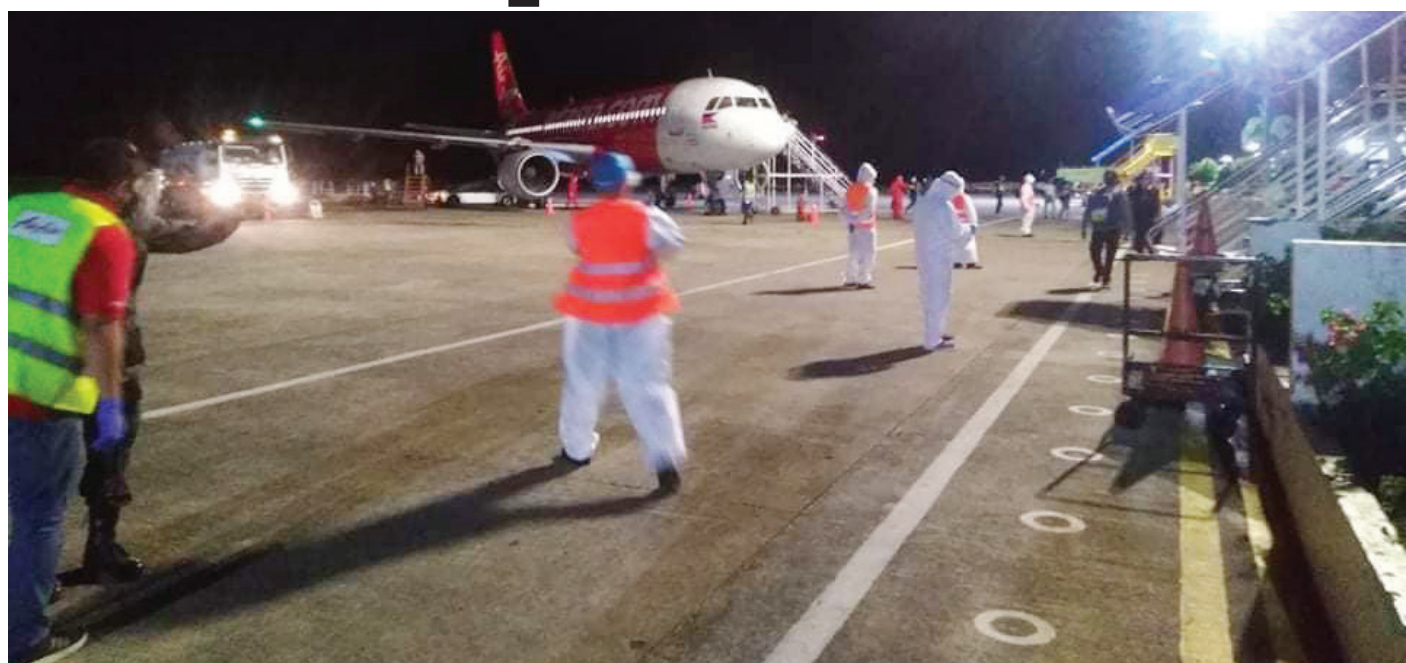
OFW RETURNEES. The Daniel Z. Romualdez(DZR) Airport is busy with commercial planes landing and taking off loaded not with regular passengers but overseas workers from different parts of the region returning after months being stranded in Metro Manila. Sadly, some of them have tested positive of the coronavirus.