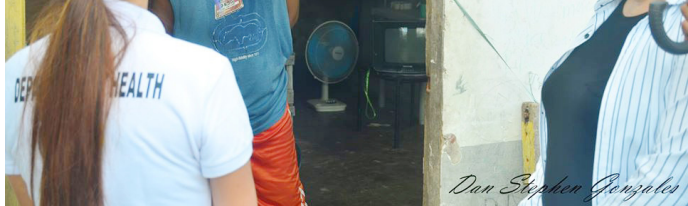
A 38-year-old male Returning Tacloban Resident (RTR) from New Hope Village in Barangay 107 Sta. Elena was brought to a quarantine facility after he was reported to breach quarantine protocols on Monday (June 1).

The said move was recommended by the City Health Office after it was