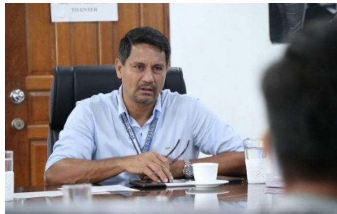
STRONGER COORDINATION. Ormoc City Mayor Richard Gomez in this undated photo. Gomez on Thursday (May 29, 2020) clarified that the city accepts repatriates, so long as proper coordination and health protocols are strictly followed.