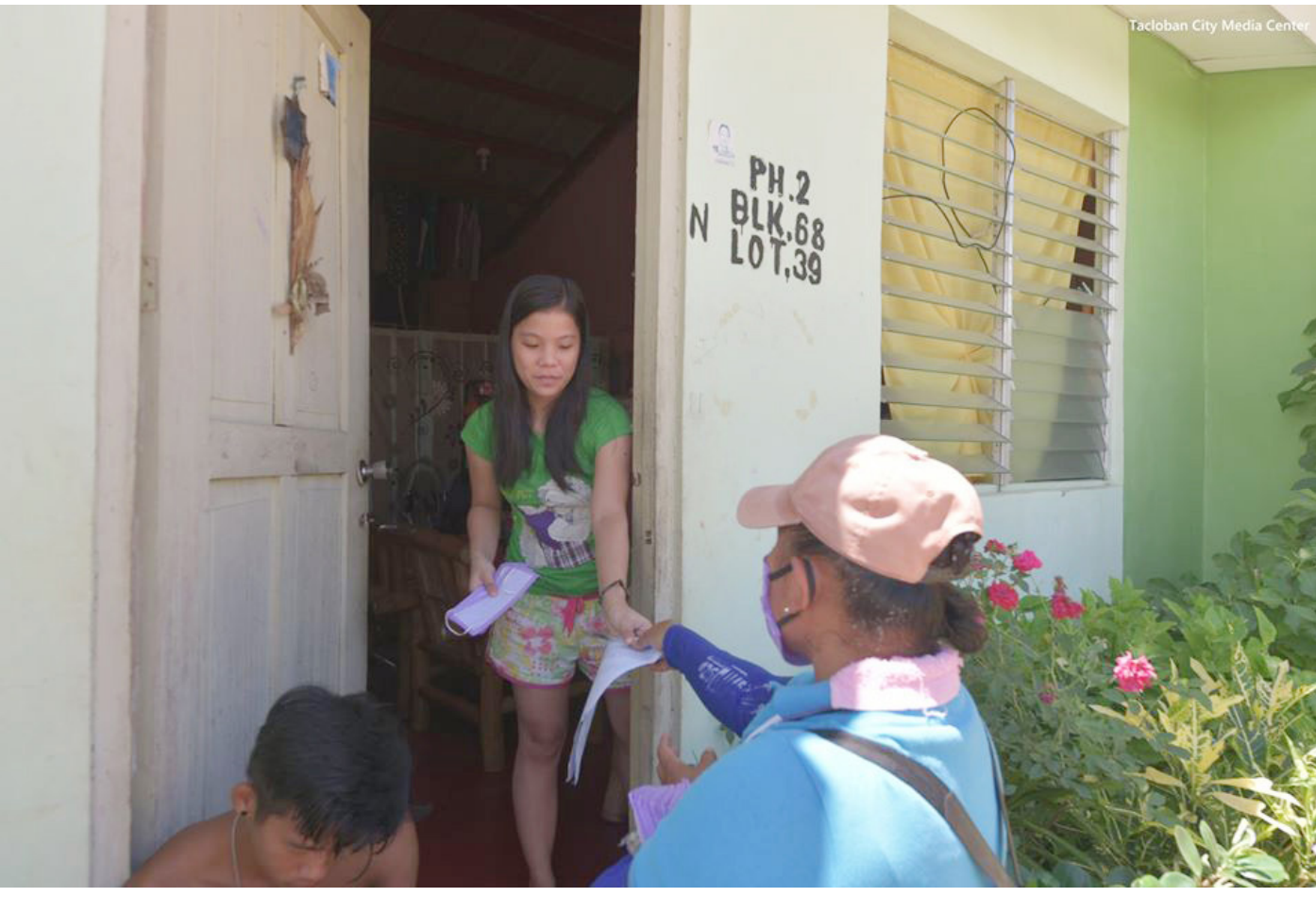
Tacloban City Media Center