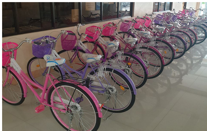
To help commuters, the municipal government of Naval in Biliran will offer free use of bicycles during this time of community quarantine. Public transport is banned under a community quarantine.