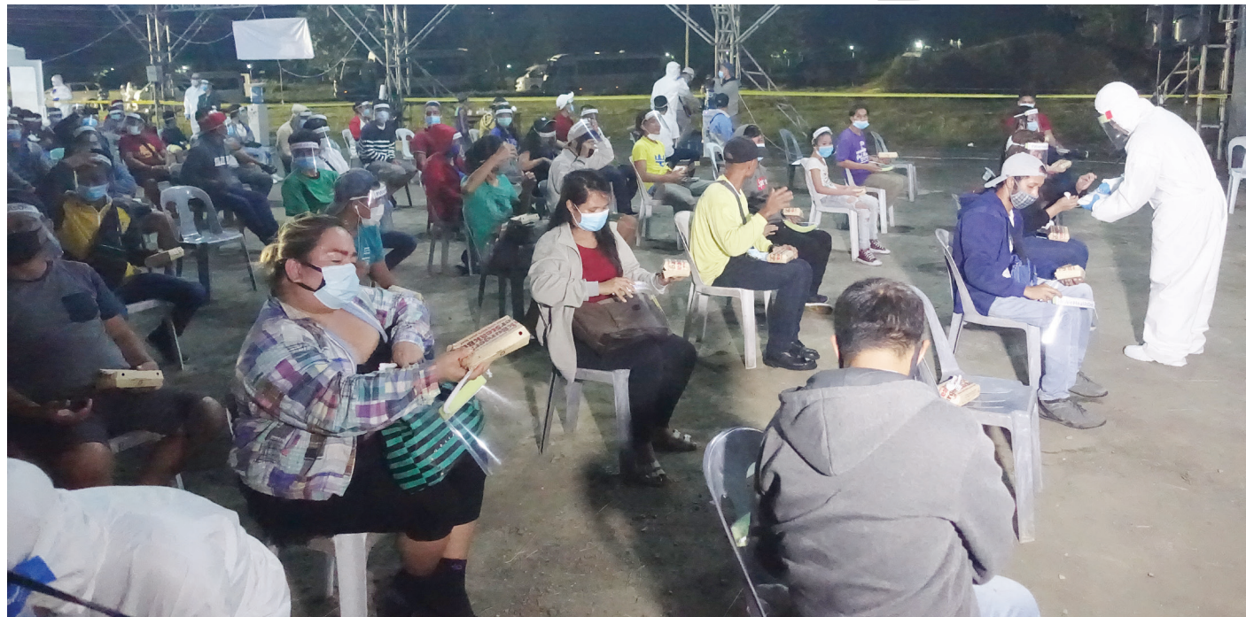
BALIK PROBINSIYA. More than 100 people from Leyte, who availed the Balik Probinsiya Program, arrived at the Government Center in Palo, Leyte on Thursday night where they were first interviewed and later swabbed.