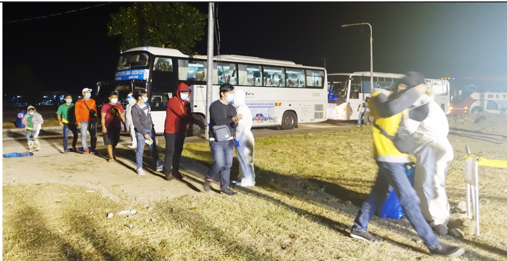
The returning Leytenos were welcomed by personnel from the provincial government who are in personal protective gear as part of the health protocols.