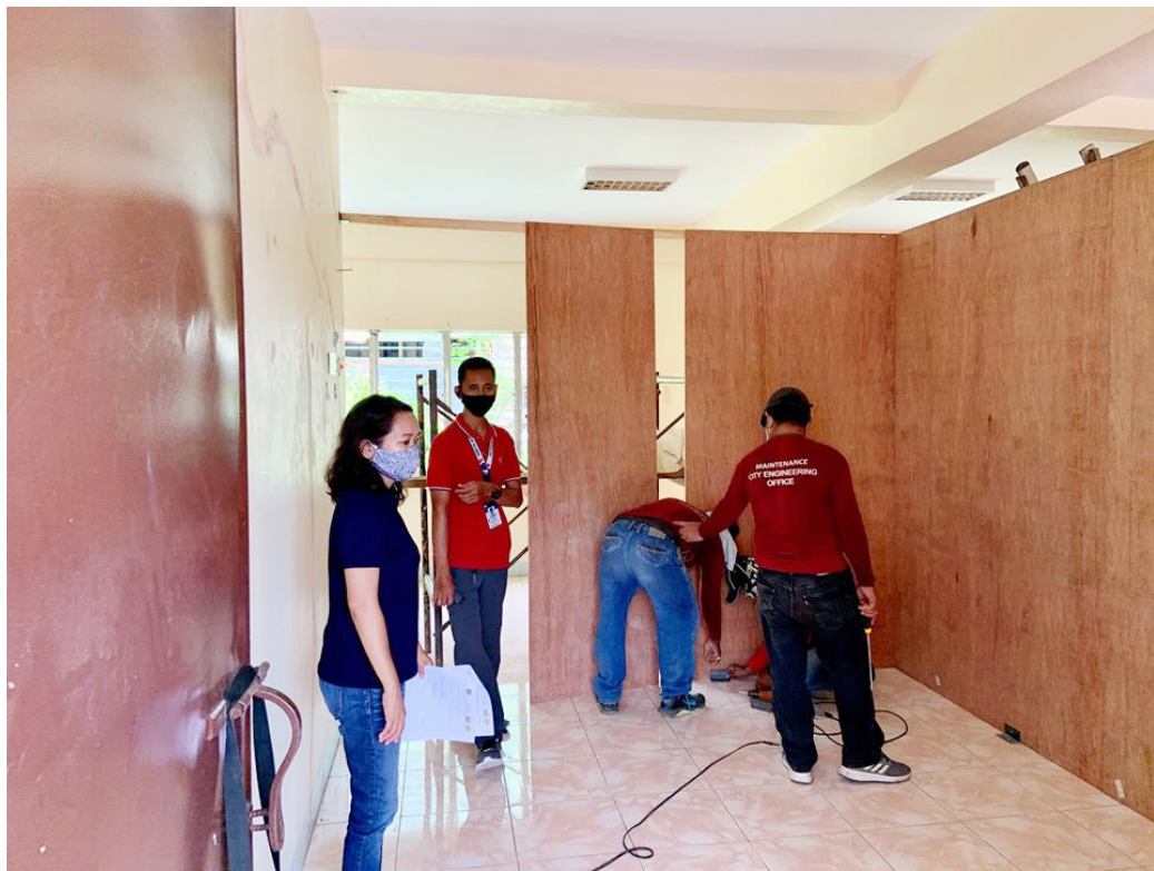
QUARANTINE FACILITY. To ensure compliance to DOH guidelines, the City Planning and Development Office (CPDO) conducted an ocular inspection of the Abucay Evacuation Center which will be used as a community quarantine facility for returning Tacloban residents with no capacity for home quarantine. The facility can cater to 30 occupants and will be ready by the end of the week.