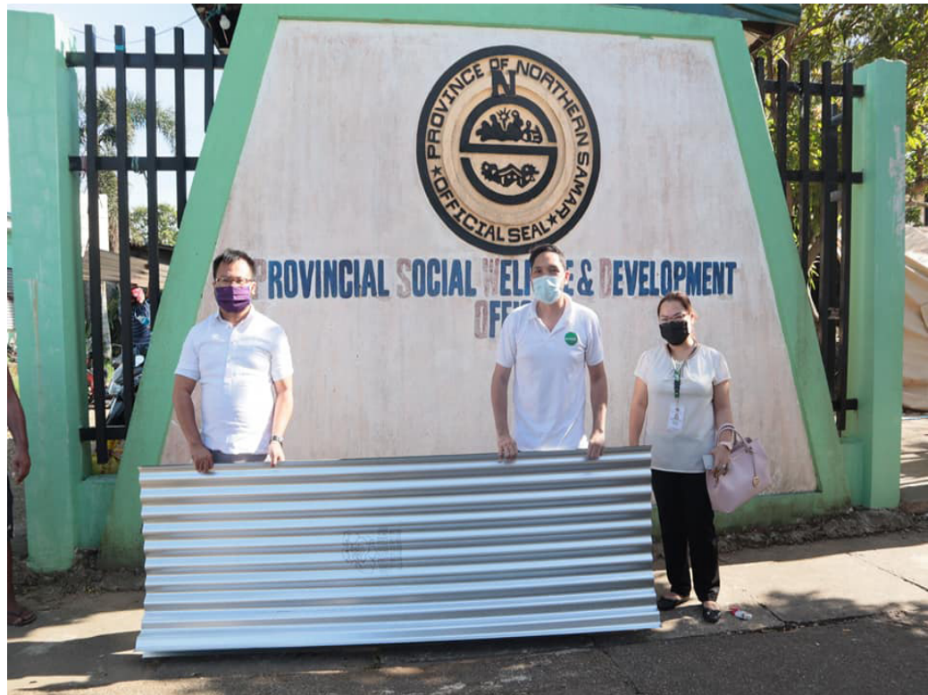
The An Waray party-list group donated 2,000 galvanized iron sheets to the provinces of Eastern Samar and Northern Samar which were both hit by typhoon 'Ambo.'

TACLOBAN CITY - About 2,000 galvanized iron (GI) sheets were donated by the An Waray party-list groups to the typhoon victims in Eastern and Northern Samar provinces.