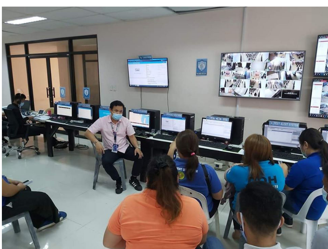
The City Management Information System Office conducted an orientation with Tacloban City Health Office personnel on the registration process of Balik Tacloban Project. The Balik Tacloban Project is a program of the local government to assist returning residents. The process includes the registration of returning residents, assessment and validation of the documents attached, visitation of indicated residence of the returning residents and issuance of travel clearance.(TACLOBAN CITY INFORMATION OFFICE)