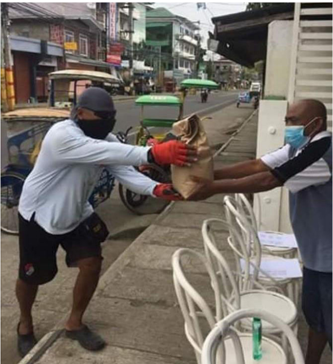
Amidst the coronavirus disease 2019(COVID-19) pandemic, kind souls shines like in Maasin City where good Samaritans provided food relief to ‘potpot’ drivers whose daily income was affected due to the general community quarantine imposed by the city government.