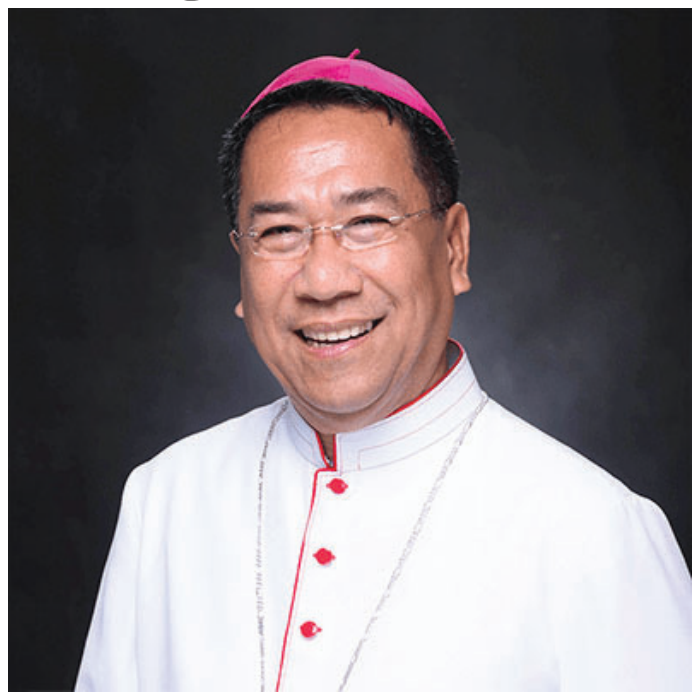
ARCHBISHOP JOHN DU