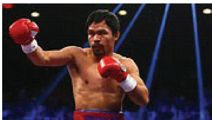
8-division boxing champion Manny Pacquiao

The fighting senator has been inactive inside the ring for almost a year. His last fight was August 2019 where he earned a