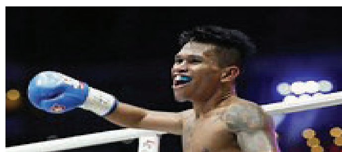
Ormoc City native and WBO bantamweight champion Johnriel Casimero.

Casimero's handlers say that there's no turning