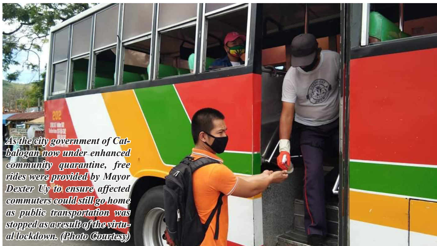
As the city government of Catbalogan now under enhanced community quarantine, free rides were provided by Mayor Dexter Uy to ensure affected commuters could still go home as public transportation was stopped as a result of the virtual lockdown.