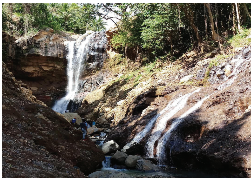
At least P105 million was allocated by the Department of Public Works and Highways in Biliran province to construct a road leading to Talustusan Falls in Naval town. (DPWH-BDEO)

According to Adongay, the project has a total length of 4.715 kilometer