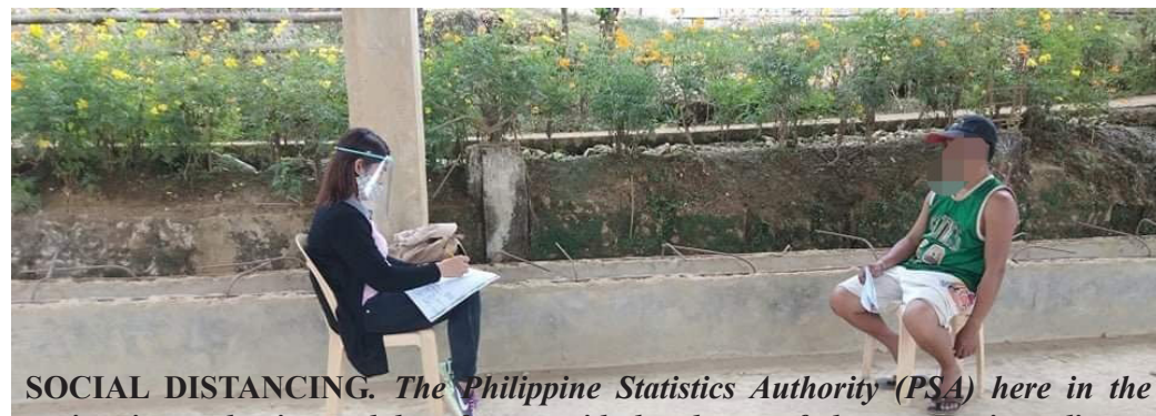
SOCIAL DISTANCING. The Philippine Statistics Authority (PSA) here in the region is conducting a labor force amid the threat of the coronavirus disease 2019(COVID-19). But the agency said that they are practicing the protocols like the wearing of face mask and social distancing as shown in the photo during a survey in Albueria, Leyte. (PSA)

Of these respondents, 777 of them will come from Leyte;390 from Eastern Samar;387 from Biliran;389 each for both Northern Samar and Samar; and 384 for Southern Leyte.