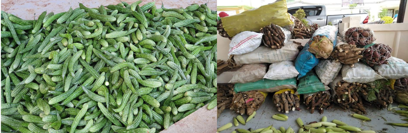
The local government unit of Calbiga, Samar purchases all harvests of the agrarian reform beneficiaries (ARBs) to give variation to the relief assistance provided to its residents.