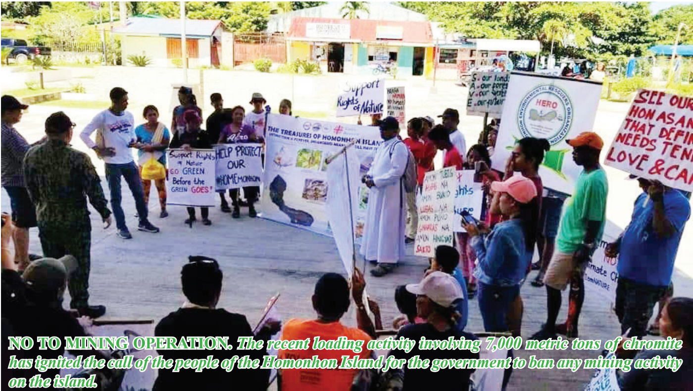
NO TO MINING OPERATION. The recent loading activity involving 7,000 metric tons of chromite has ignited the call of the people of the Homonhon Island for the government to ban any mining activity on the island.