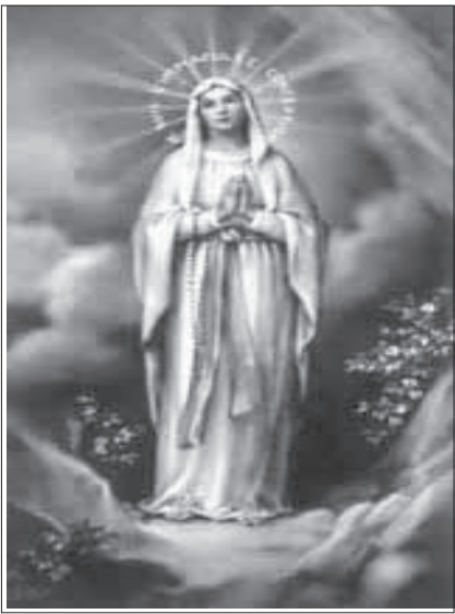
Pray the Holy Rosary daily for world peace and conversion of sinners (The family that prays together stays together)

Commentaries from readers whose identities they prefer to remain anonymous can be accommodated as "blind items". It will be our editorial prerogative, however, to verify the veracity of such commentaries before publication.