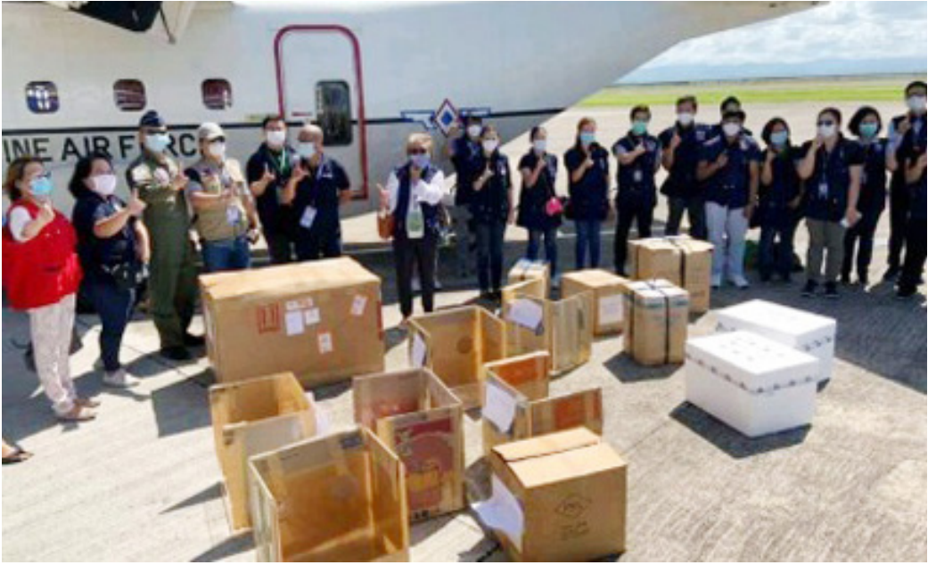
EQUIPMENT FOR TEST LAB. Health experts from Manila on Thursday (April 17, 2020) arrive at the Tacloban airport with the RT-Polymerase Chain Reaction Machine needed for the coronavirus disease 2019 testing laboratory in the city. The team was in the city for the onsite assessment of the proposed laboratory.