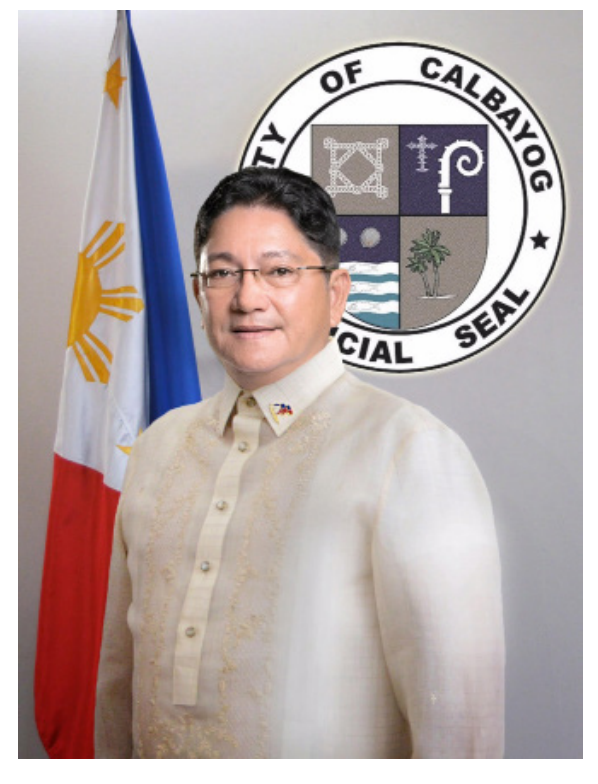
MAYOR RONALD AQUINO