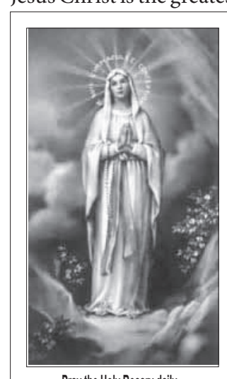
Pray the Holy Rosary daily for world peace and conversion of sinners (The family that prays together stays together)

For the whole Christian world, the coming of Jesus Christ is the greatest