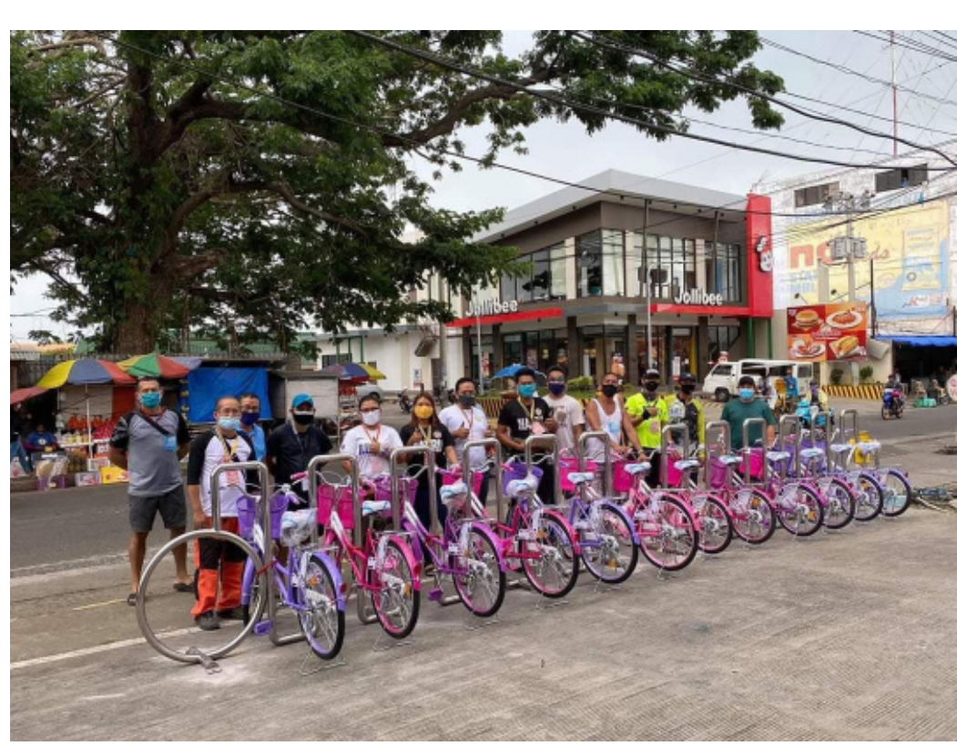
The bicycles donated by a private firm for health workers in Naval, Biliran. A local firm has donated 12 bicycles to inspire front-liners in their fight against the coronavirus disease 2019.

Business hours: 10:00 AM - 9 PM Tel. Nos. : 0910804 3086 / 09209296880