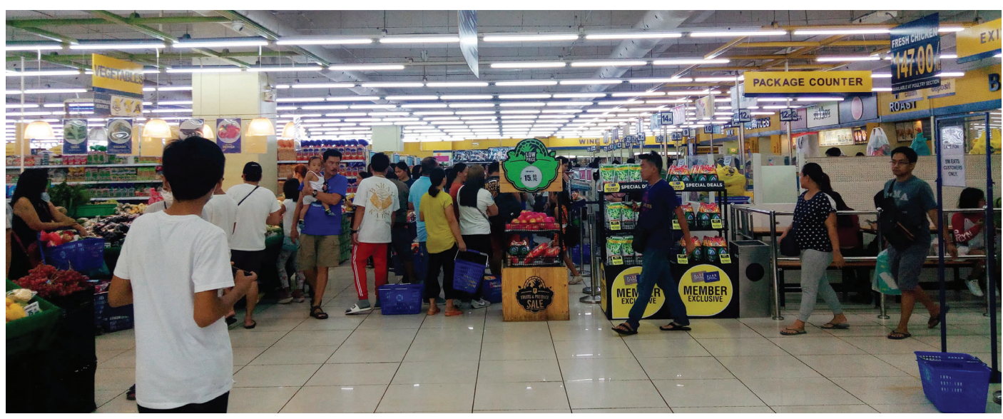
PANIC BUYING. As the entire country is grip with the coronavirus disease 2019(COVID-19) scare, among the immediate reactions of the public is to snap some health essentials like alcohol and face masks, causing long line of buyers at various business establishments as shown in the photo. The Department of Trade and Industry has imposed a price freeze on these items.