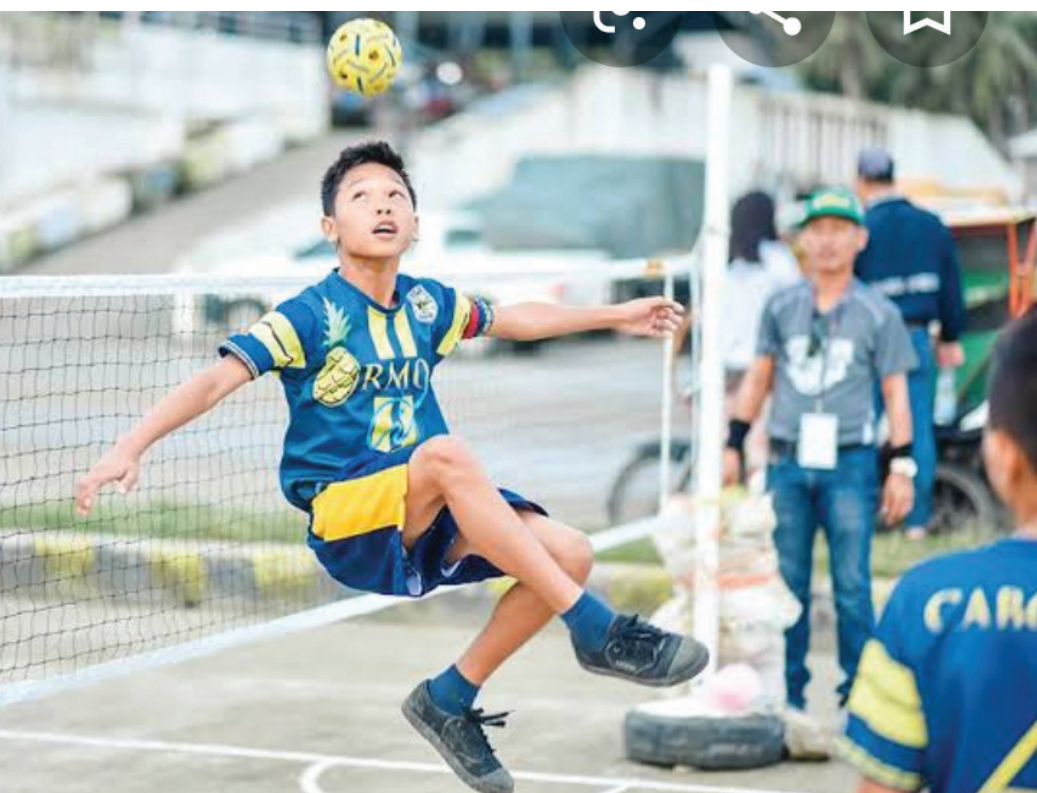
File photo of Sepak Takraw competitions during the previous EVRAA Meet.