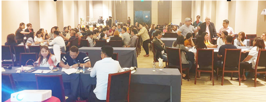
With still no known cure on the dreaded coronavirus 2019(COVID-19) with the number of persons getting infection keep on increasing, its impacts are becoming more felt. In the region, business owners who cater on tourism-related services have admitted to have suffered huge losses. (ROEL T. AMAZONA)

TACLOBAN CITY – The region's tourism industry is now feeling the heat caused by the coronavirus disease 2019(COVID-19) scare.