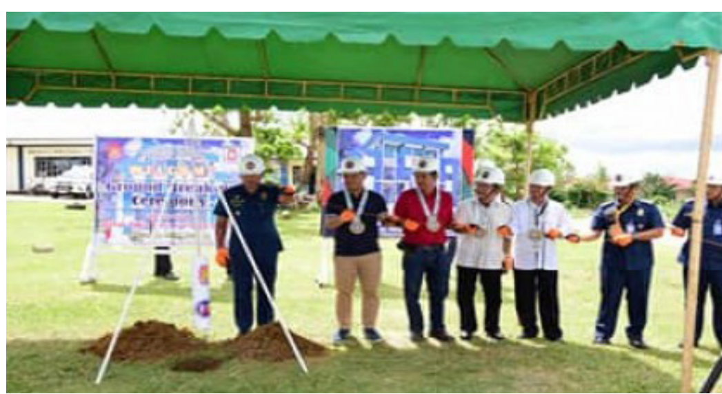
NEW OFFICE BUILDING. Officials of the Department of Public Works and Highways (DPWH) and the Philippine National Police (PNP) lead the ceremonial groundbreaking ceremony of the new Biliran Provincial Police Office building construction on Feb. 18, 2020, at Larrazabal village in Naval. The DPWH said the construction of the new provincial office in Eastern Samar has also started.

has started. Biliran held its groundbreaking on Feb. 18 at Larrazabal village in Naval town while Eastern Samar on Feb. 20 at Camp Acedillo in Alanagalang village Borongan