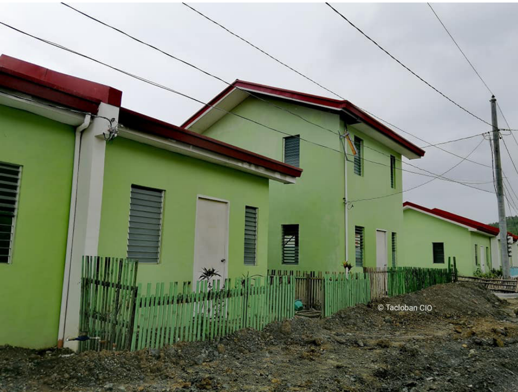
The Dreamville. Permanent housing project of the Catholic Relief Services in Brgy. Bacagay, Tacloban City where 200 households from Paseo de Legaspi and Anibong/Rawis Districts were relocated starting February 27. The city government will be assisting the families who have been issued notices of award and keys to the new units, as they relocate to Phase 1 of the housing project.