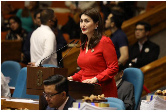
Tingog party-list Rep Yedda Marie K. Romualdez delivers her sponsorship speech at the plenary of the House of Representatives regarding her authored House Bill 5989 Creating the Department of Disaster Resilience. Romualdez stressed that she will continue working for the creation of the bill which will be primarily responsible for leading, managing, and organizing the national effort to reduce disaster risk, respond to disaster recover, rehabilitate and build after the disasters.

“A foreign investor interested in investing in Eastern Visayas need not go to all the local government units in the regions or to a disinterested national government agency. He doesn’t even have to be in Tacloban. But through EVDA, one can get the right and concise information and support