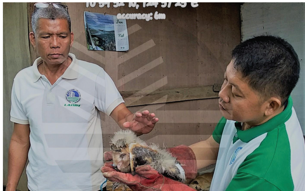
An Eastern Grass Owl ( Tyto longimembris ) rescued by DENR CENRO Ormoc personnel in Kananga, Leyte.