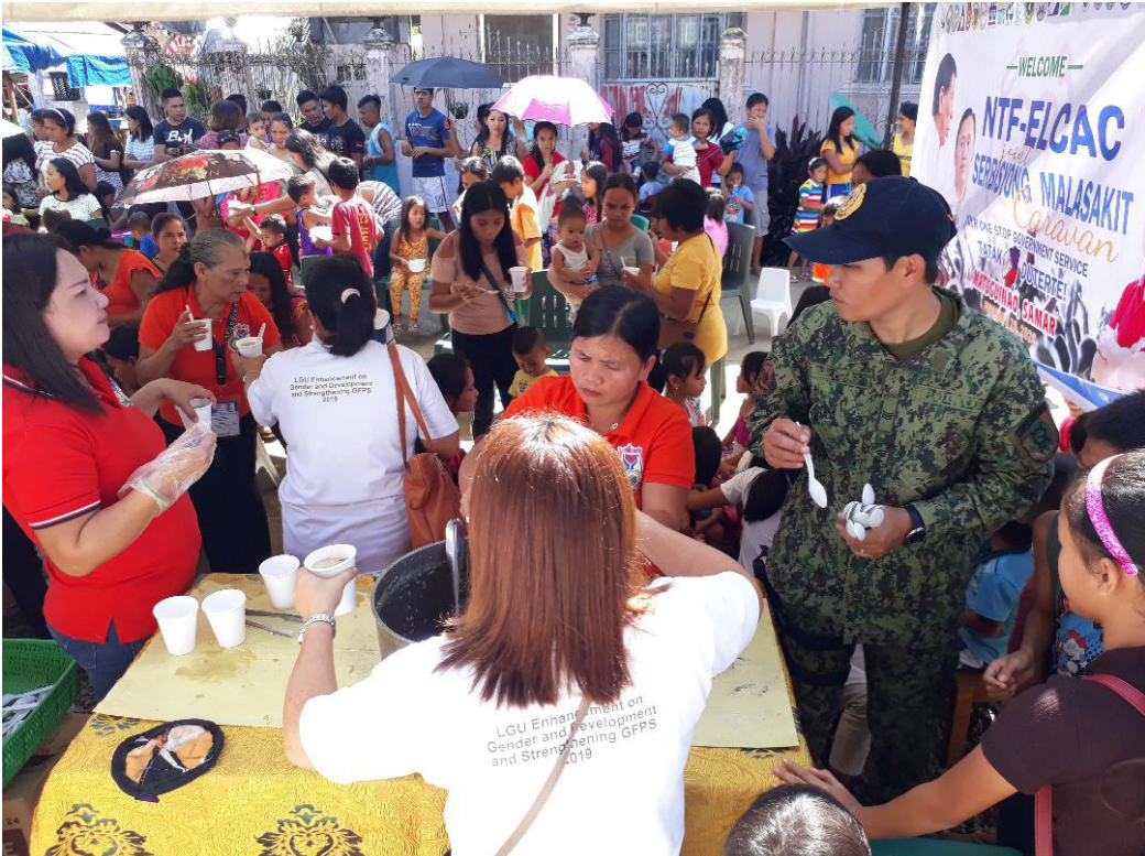
Matuguinao residents availed government services provided at the Malasakit Caravan of the Office of the Presidential Adviser for the Visayas.