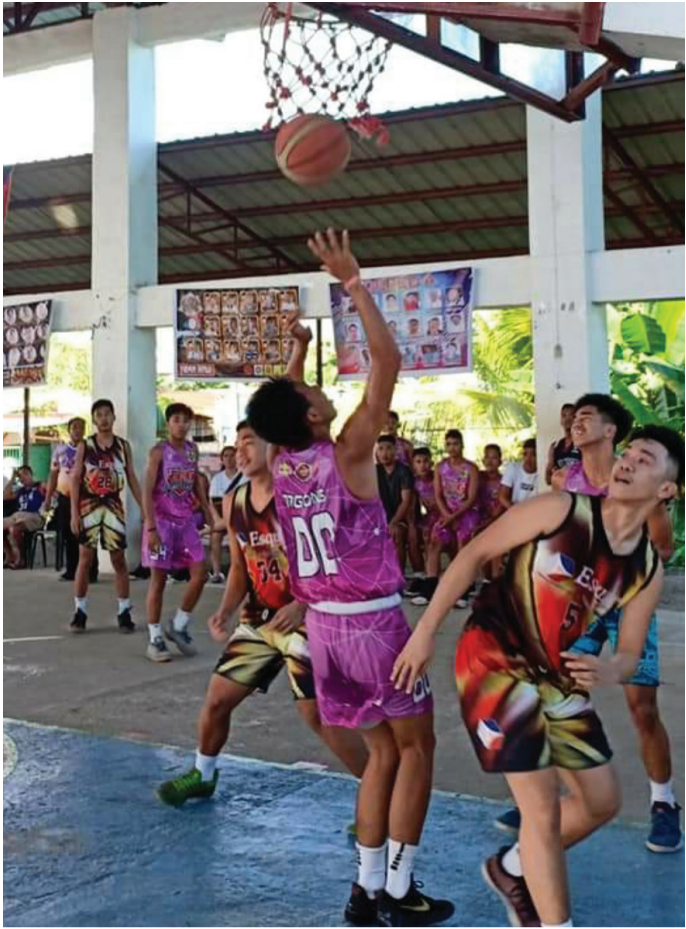
File photo of an exciting game during the 4th season of the Aramyaw Ballclub Basketball League.