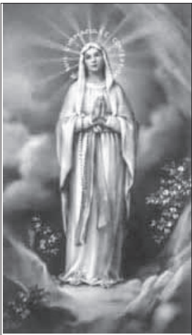
Pray the Holy Rosary daily for world peace and conversion of sinners (The family that prays together stays together)

While there is basis to the observation that civil servants are poor in terms of performance, such observation appears as half-truth for just being based on one side of the coin. The other un-