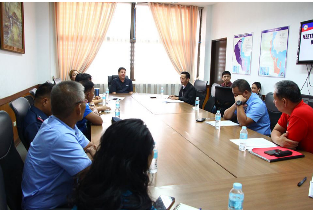
Tacloban City Mayor Alfred Romualdez tasks barangay officials to conduct road clearing and obstructions on their respective areas as directed by the Department of Interior and Local Government.