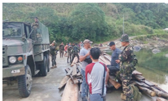
Joint operation with law enforcers in 2019 resulted to the arrest and criminal prosecution of environmental laws violators.