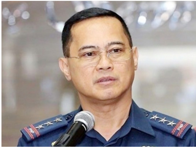
POLICE GENERAL ARCHIE GAMBOA

CAMP RUPERTO KANGLEON, PALO, - Leyte- Police General Archie Gamboa lead the fitness exercise activity at the Police Regional Office 8 (PRO8), as part of his program to strictly enforce the body mass index, or BMI, wherein a police officer is required to maintain his ideal weight. Gamboa, on his Tuesday(Feb.4) visit, said that the national headquarter said they are optimistic to attain the target with overweight policemen who have committed to losing two to three kilograms of their weight every month. The national headquarters is targeting to achieve the ideal body mass index (BMI). The police chief said that he did not set any deadline to attain the ideal weight but policemen must show that they have monthly improvement or at least 2 to 3 kilogram loss of weight. The program covers from the highest ranking