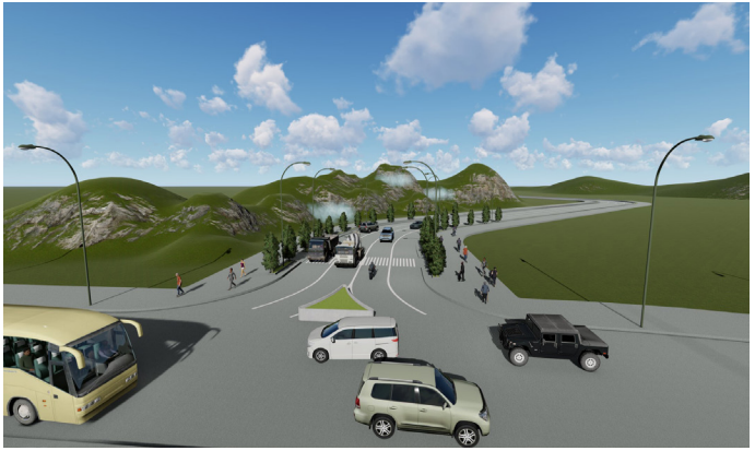
Borongan by-pass road

BORONGAN CITY- Based on General Appropriation Act (GAA) for year 2020, the Department of Public Works and Highways (DPWH) Eastern Samar District Engineering Office (ES-DEO) is set to implement 113 various regular infrastructure project such as roads, flood control and public buildings amounting to P1.940 billion. According to District Engineer Manolo A. Rojas, the amount is intended to fund programs that ensure safe and reliable national road system (P758.721 M), projects that protects lives and properties against floods (P713.283 M), convergence and special support program (P145.00 M) and local infrastructure projects (P323.5 M). Huge slice of funds will be allocated to high impact projects such as the construction of Artech, Brgy. Catum-san- Jipapad- Las Navas- Catubig- Rawis Road, P120.00 million; construction of Borongan Bypass Road, P100.00 million; construction of