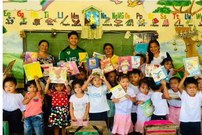
A mobile library has been put up by the municipal government of Carigara, Leyte to help raise interest among kids of the town, especially those in the remote villages.