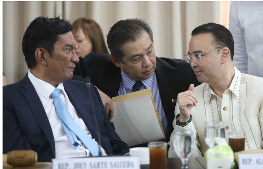
House Majority Leader and Leyte Rep. Martin Romualdez (center) huddle with House Speaker Alan Peter Cayetano (right) and Committee on Ways and Means Chairman Rep. Joey Salceda during a committee meeting regarding on priority tax measures at the House of Representatives.

There are two basic types of life insurance policies - term and cash value whole life. The most basic form is term life insurance regarded as pure protection whose only purpose is to pay your beneficiary if you die and is generally much cheaper, especially at younger ages. But its cost goes up as you get