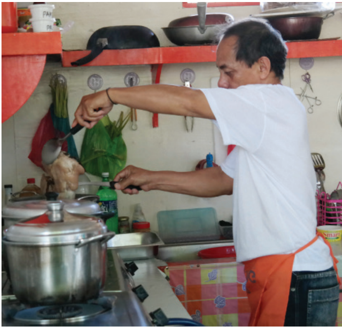
A cook prepares food at the Food Service Sector Laboratory (FSSL) located at the provincial capitol’s premises in Eastern Samar. The laboratory is also used as a learning facility to promote the province’s authentic cuisine and delicacies to locals and tourists.

At least six stalls and one “Pasalubong” Center were established at the provincial capitol’s grounds to showcase locally manufactured food and non-food products. “The FSSL is a platform to encourage local tourism stakeholders to engage in livelihood, purposely to achieve additional income for the family and eventually help reduce poverty in the province,” added Robedizo. According to Robedizo, the laboratory’s tenants are the ones who teach those who would like to learn the local cuisine. People will learn to cook easily because all food of-