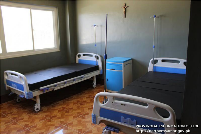
The expanded Northern Samar Provincial Hospital is now in full operation beginning today, March 16, doubling its current bed capacity to 200. Its patients could now feel more comfortable with new equipment and spacious rooms.

General practitioners or family practice doctors