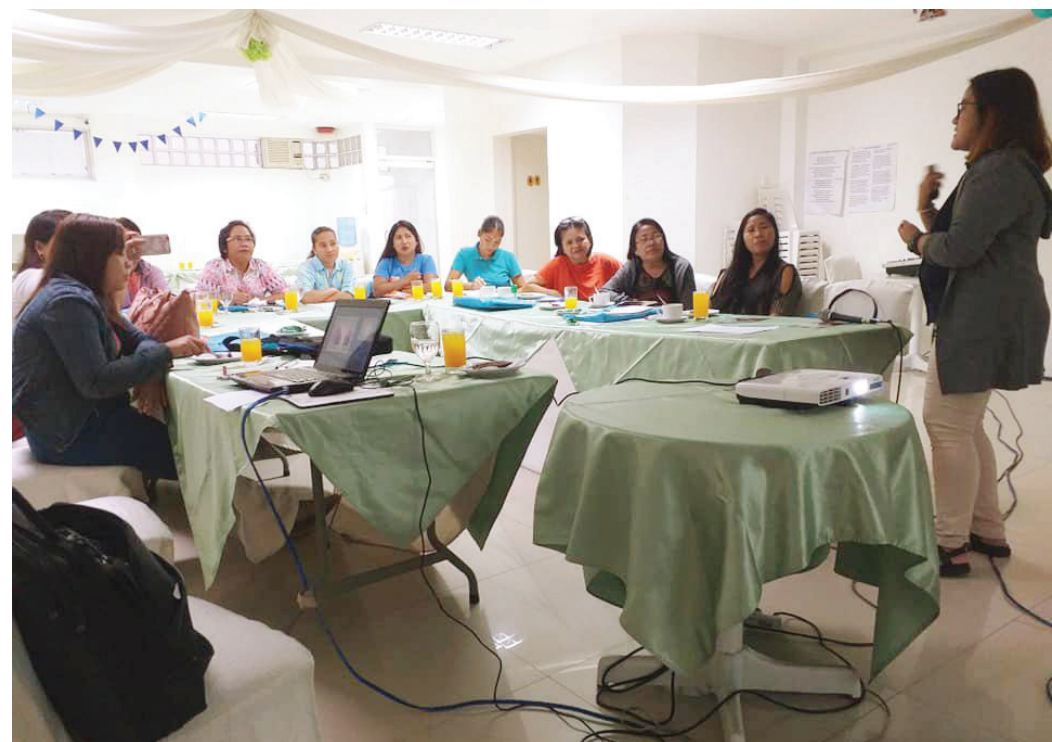
Sari-sari store owners from Samar and Leyte underwent a series of training under Project PREMIUM to strengthen their business skills.

"We at DILG, we don't involve in politics. Ours is to implement programs (which include