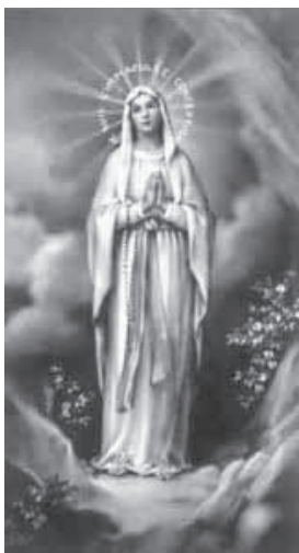
Pray the Holy Rosary daily for world peace and conversion of sinners (The family that prays together stays together)

cumulatively condition and enrich the fertility of the soil, increase farm productivity, reduce pollution and destruction of the environment, prevent the depletion of natural resources, further protect the health of farmers, consumers, and the general public, and save on imported farm inputs. To